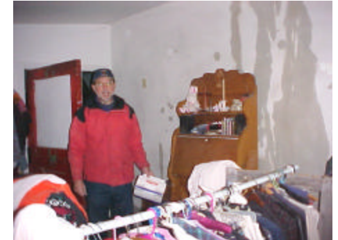
Mar.'04 - rain forced us indoors into temporary quarters downstairs! We moved upstairs in May so old walls could be knocked out; new walls, floors & windows appeared next.