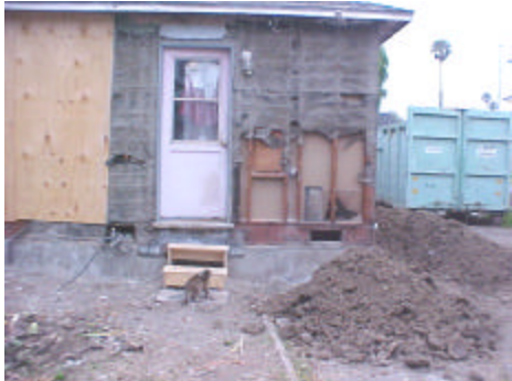
June & July 2003 – foundation and structural work; even with the water heater outside, we still had hot, running water!