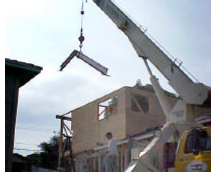
Oct.'03- Feb.2004 – insulation, windows, interior walls, stucco and plaster; new deck and balcony work begun.