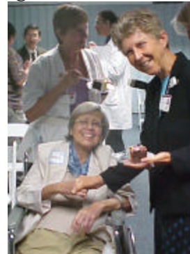
April 2004: Grace traveled back to Simi Valley in order to be honored as a medical Miracle.