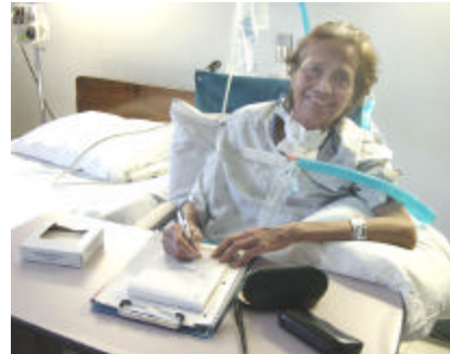
Nov. '03: first time out of bed