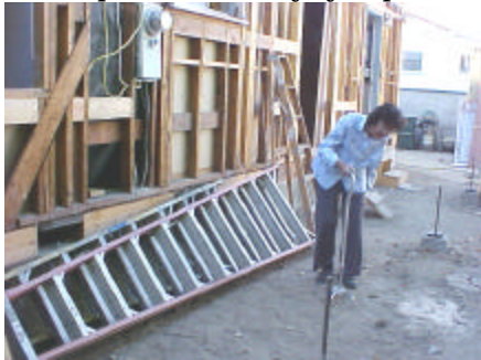
Aug. '03: looking at the construction